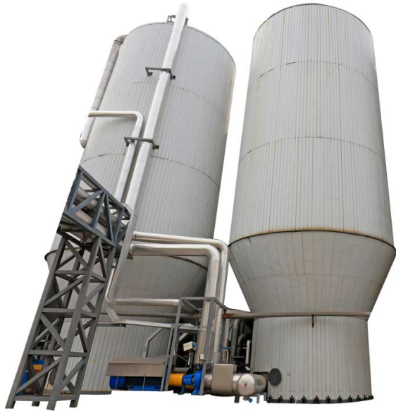
TDZ3 Smart HART TT