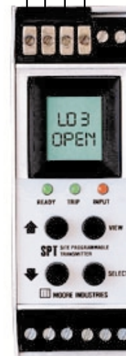
SPT Site-Programmable Temperature Transmitter

Total Sensor Diagnostics Locates and Displays Sensor Problems