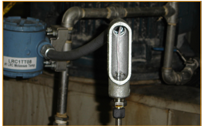
Figure 2. The stainless steel tubing connects to conduit. The retainer clip for the WORM sensor is visible at the bottom of the conduit.

Since we installed the custom thermowell and the WORM, temperature measurement is much more accurate, and the sensor responds quickly to changes in temperature. This allows more precise control of the water and steam