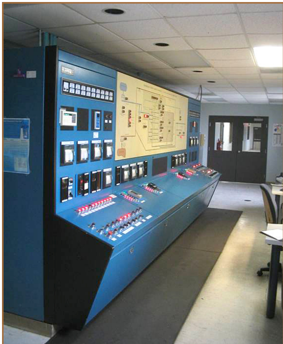
Figure 3. Original analog control system at Otisco Lake Water Treatment Plant, Onondaga County Water Authority.

In addition, OCWA wanted to reduce wiring and instrument maintenance costs at its water treatment facility. This would require the elimination of multiple long cable runs between sensors, actuators and controls, and a solution for collecting multiple sensor/control pairs near their point of installation. Such an approach would do away with hundreds of previously installed twisted pairs, cable trays, complex wiring diagrams, and associated maintenance.