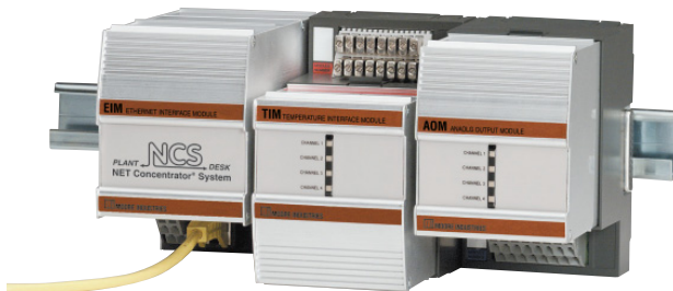
Figure 6. Moore Industries' NET Concentrator System (NCS) provides a solution for Distributed I/O and Remote I/O.

communications using standard Ethernet cables, LAN switches and routine Ethernet hardware (Figure 6). The Distributed I/O and Remote I/O System functions as a universal signal gateway that interfaces with OPC-compatible DCSs or PLCs, and works over 10/100Base-T Ethernet (MODBUS/TCP) and MODBUS RTU networks. The system includes a communications module plus multiple I/O modules. Each I/O module supports multiple analog or discrete channels that interface to remote sensors, switches, actuators and displays. Each analog input channel incorporates its own 20-bit A/D input. This guarantees that no resolution from the existing analog transmitters will be lost when the signal is transmitted over the Ethernet network to the host system.