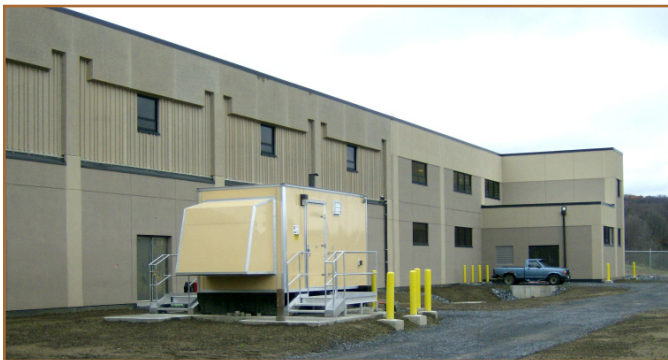
Figure 1. OCWA's water treatment plant in the town of Marcellus, New York, has undergone infrastructure improvements designed to enhance its overall performance.

Water first enters the Rapid Mix tank where a coagulant (polyaluminum chloride) and a taste and odor control chemical (powdered activated carbon) are added. After 30 seconds of mixing, the water enters the Contact Basins where calm conditions allow the coagulant to make small particles adhere together to form larger particles. Some of these particles settle and are cleaned out later. The contact time in the basins also allows the powdered activated carbon (used during times of high algae growth in the lake) to absorb organic taste and odor causing chemicals.