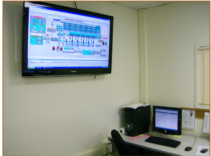
Figure 4. Process functions are now controlled through a PC/PLC-based control system.

Key to the control system upgrade was the implementation of Distributed I/O and Remote I/O—specifically a solution employing isolated I/O modules to eliminate signal loop interference on the Ethernet control network. This would stop ground loops and signal aberrations at any location from affecting other measurements in the facility. Digital communications, in place of analog signals, also eliminates sensor and control signal degradation (and associated calibrations) and cross communication (noise) commonly associated with “analog-only” communications.