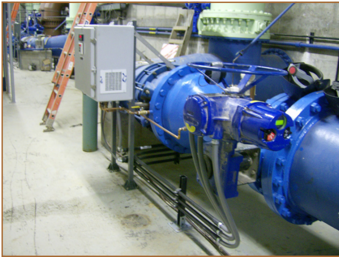
Figure 5. As part of the improvements, automated valves were installed and connected to the instrumentation network.

After considering alternative vendor offerings, OCWA's project team decided upon the NET Concentrator System® (NCS) from Moore Industries. This smart I/O system takes advantage of "cable-concentrating" technology, which eliminates point-to-point cable, conduit and wire trays by sending process monitoring and control signals between the field and control room on a single digital communication link. The system provides true signal isolation, with isolated modules for both analog and digital I/O. All discrete and analog signals are digitized, packetized and communicated via Ethernet